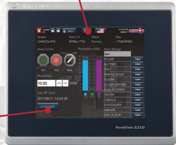
PanelView 5310 Graphic Terminal

Pre-built content helps create an easy-to-use view into an application