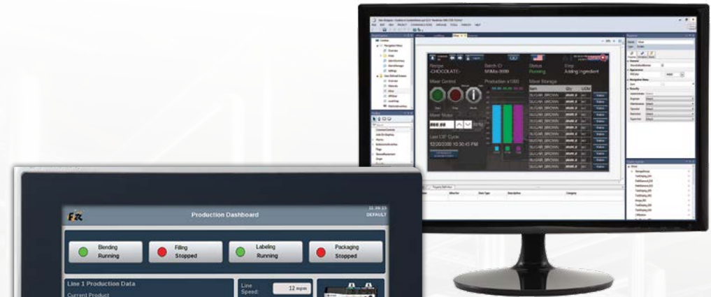
Studio 5000 View Designer Software