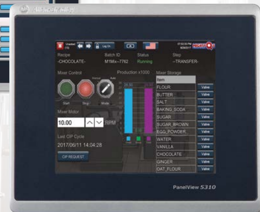
PanelView 5310 Graphic Terminal