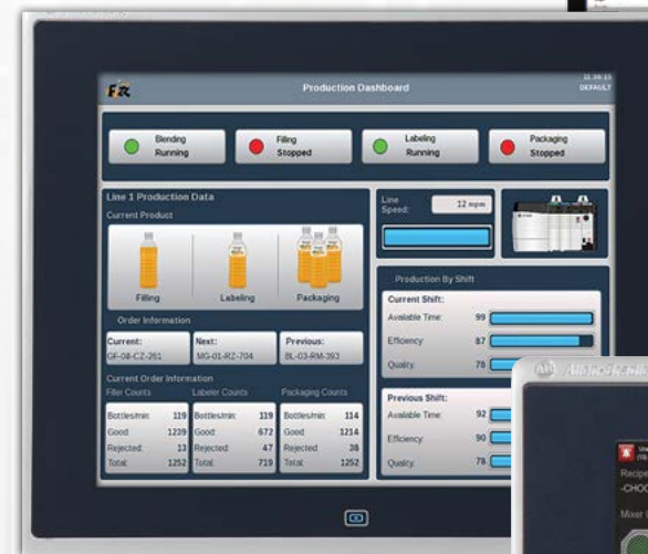
PanelView 5510 Graphic Terminal