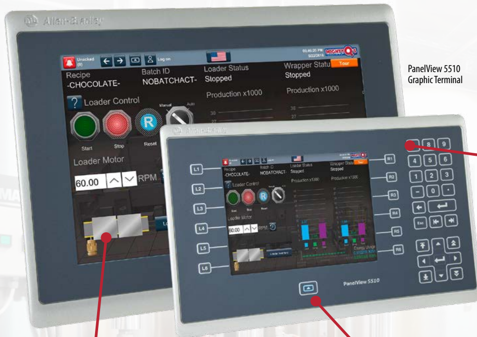
PanelView 5510 Graphic Terminal

Customizable system banner to provide system information on your screens